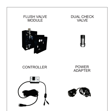
FIT-OFF KIT JURS100.401