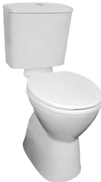
Plaza soft-close seat