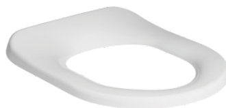
Single flap Assist seat