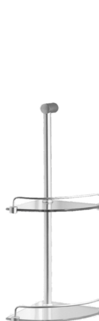
2 Shelf 535mmH

See warranty terms and conditions at: www.johnsonssuisse.com.au