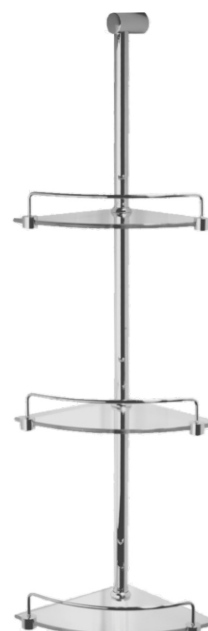
3 Shelf 770mmH

Bathroom Products Australia P/L 2/97 Banksia St Botany, NSW 2019 Tel: 1300 717 717 www.johnsonssuisse.com.au