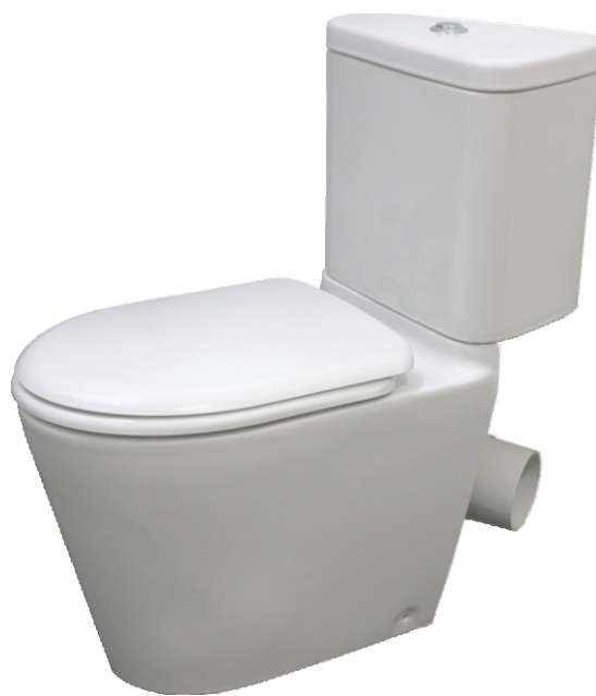
SPACE SOLUTION CORNER SKEW TRAP