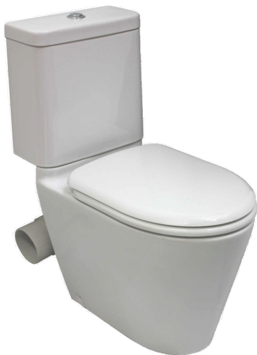
SPACE SOLUTION STANDARD SKEW TRAP